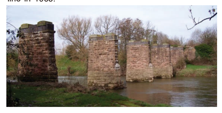
The Ross and Gloucester Railway opened on June 1, 1855 to a fanfare of trumpeting and cannon fire. A special train ran from Gloucester to Hereford carrying representatives of the Great Western Railway watched by 5000 spectators in Ross on Wye.

6. A little further are the splendid pillars of Backney Railway bridge which originally supported six spans of timber, that were removed when Beeching closed the line in 1965.