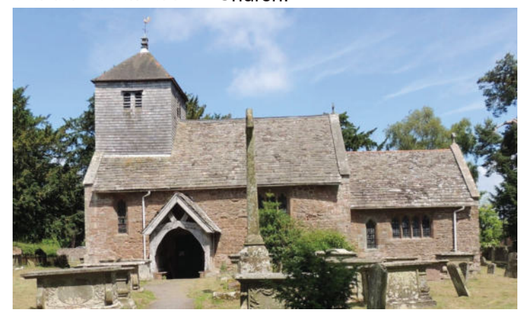
St Michael's was closed in September 2008 ending 800 years of worship on the site as the roof was unsafe.

7. Go through a wooden five bar gate and continue towards St Michael's Church.